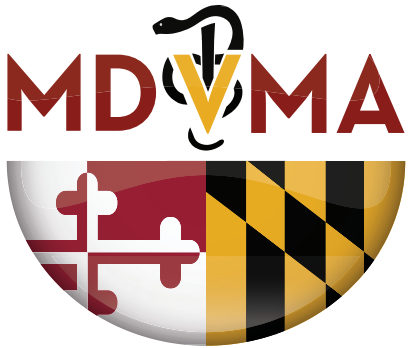
EXHIBIT & SPONSORSHIP OPPORTUNITIES